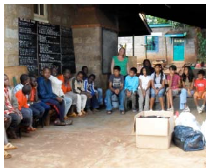
A lesson being held outside the ICC due to lack of space

The rented buildings and land have sufficed so far, but they are rapidly becoming unfit for purpose. The structure of the buildings, including the sanitation and pipes, are suffering from chronic neglect, and we have been without electricity for over a year as a result of our landlord's conflict with the Kenya Power Company over his bill. The current space is also insufficient for the sensitive work that we are doing, as we need separate and tailored spaces for the ICC's many activities. For example, there is currently only one room for education, dining, and play.