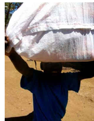
A happy child with his bed kit

We believe that this sort of networking and local cooperation has been, and will be, crucial in our efforts to fight poverty and address the issues of vulnerable children. It was gratifying to see so many children in need benefit from these bed kits, which contain the basic items necessary for good health and learning. We look forward to continuing this event in the future, and would like to thank Sleeping Children Around the World, which donated 5,000 bed kits throughout Kenya in total. We would also like to thank the Rotary Club of Thika for their continuing dedication to the welfare of Thika District.